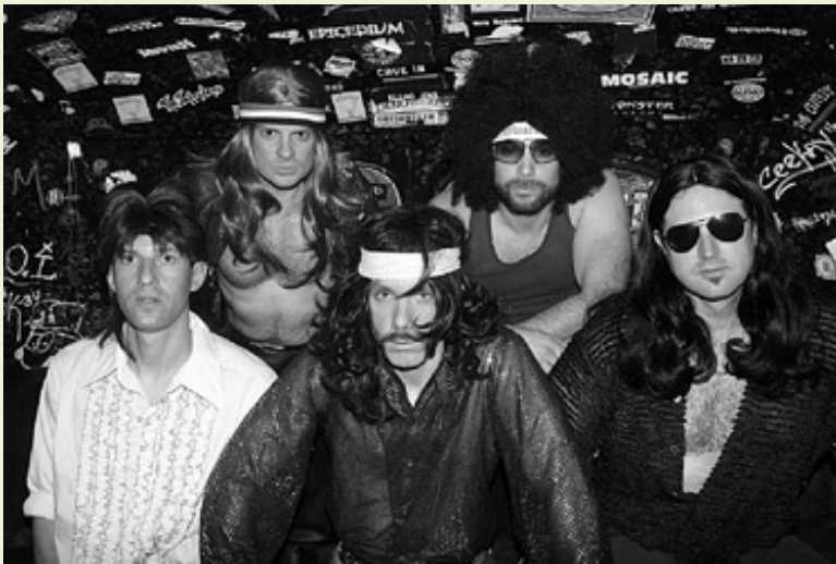
The Wayward Sons Rocked the Claremont!