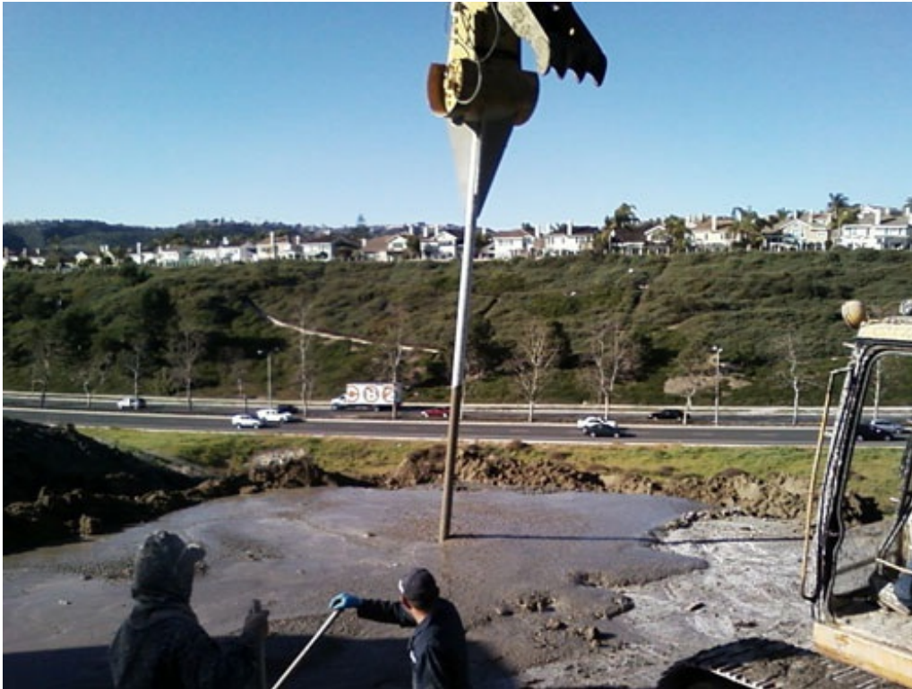
Philemon Drive Landslide Repair

2013 Medium Category Winner — GMU Geotechnical Philemon Drive Landslide Repair — Dana Point, CA