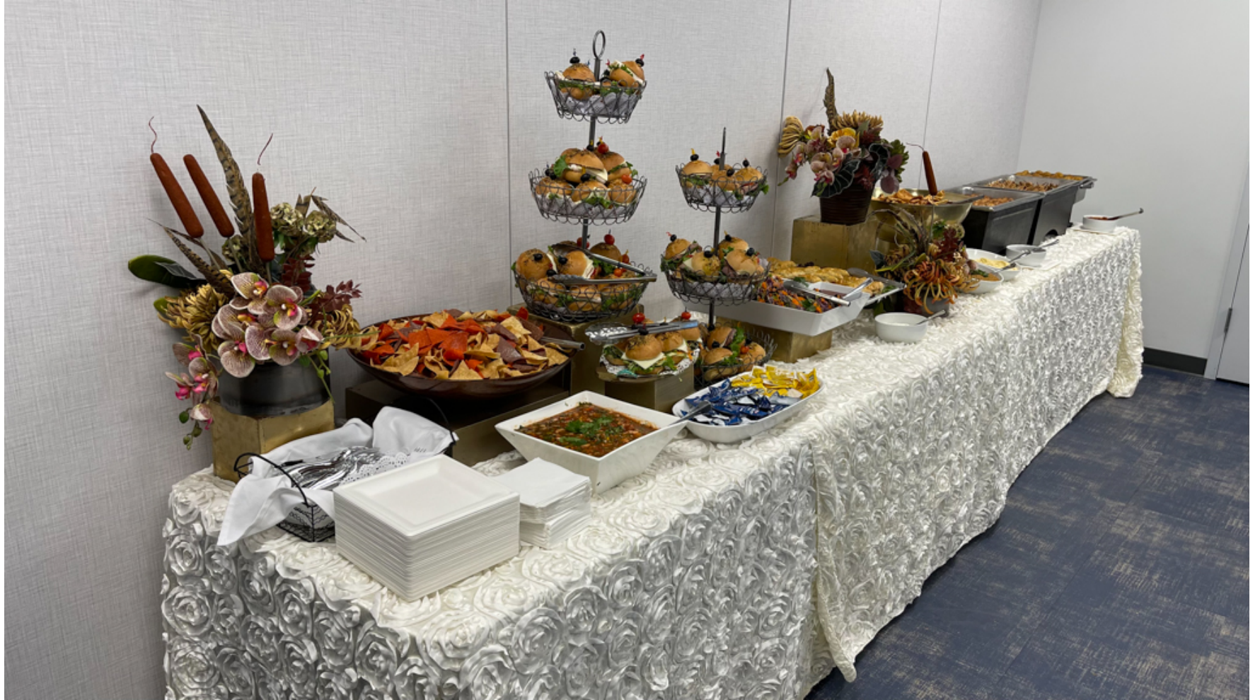
At the same time, Hannibal's Catering set out an impressive array of eight appetizers for attendees' arrival...