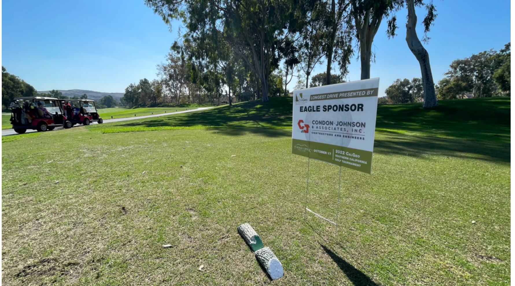
Carts stopped for more than a second at the Condon-Johnson & Associates Longest Drive hole...