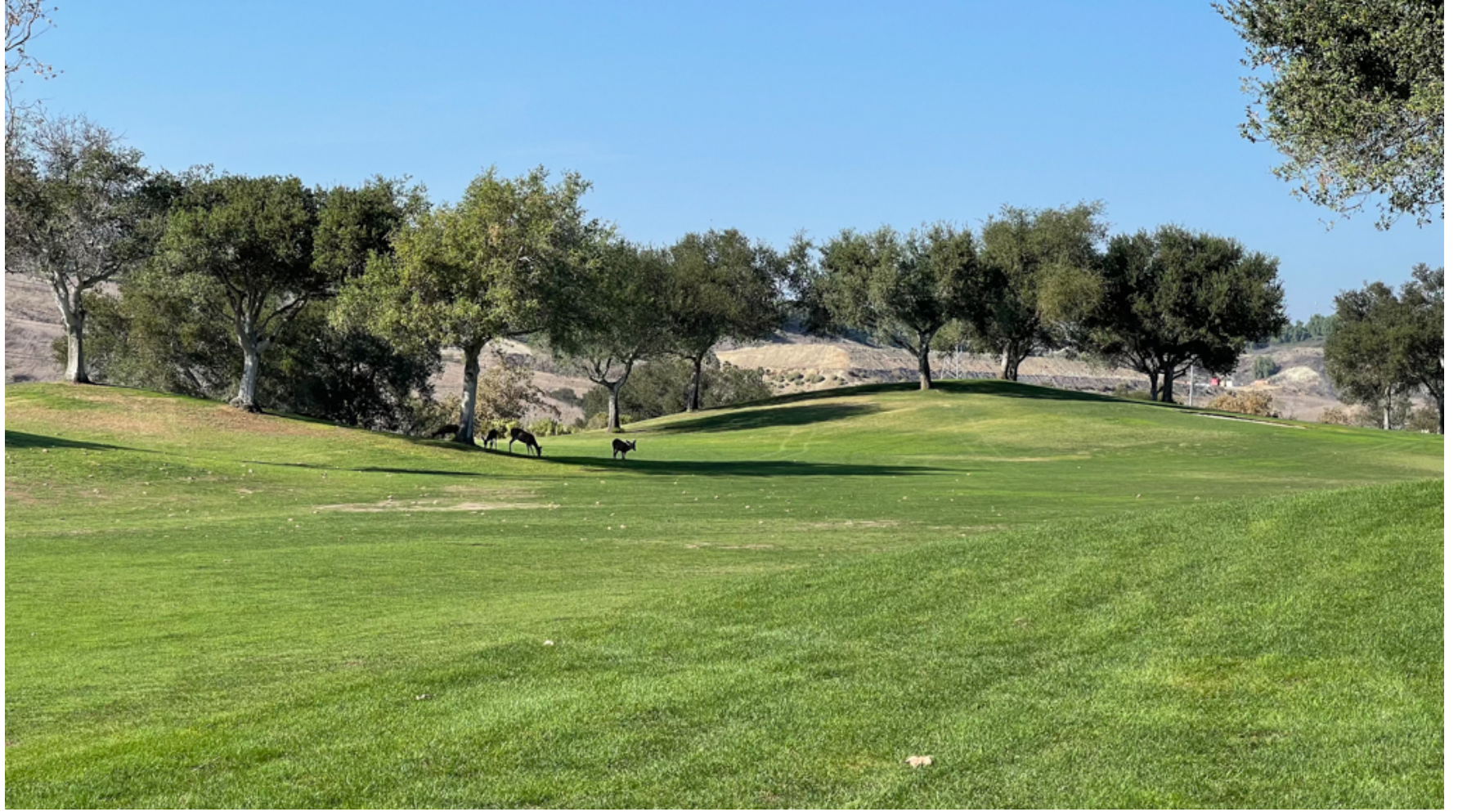
Amidst the competition and festivity of the day, players were greeted by wildlife along the rolling course as well.