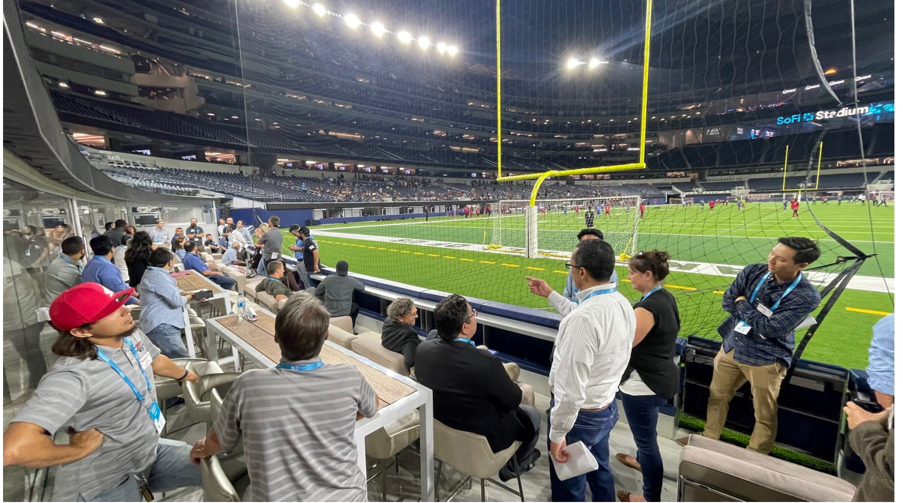
At field level, attendees took in some of the most premium views that SoFi has to offer, even when it is a local youth soccer league renting the field for the evening!